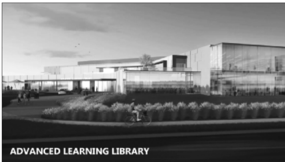
Architect drawing of the exterior of the proposed Advanced Learning Library

The design of the proposed new library will be a two story building. The first floor will include the children's pavilion for infants through elementary aged children,