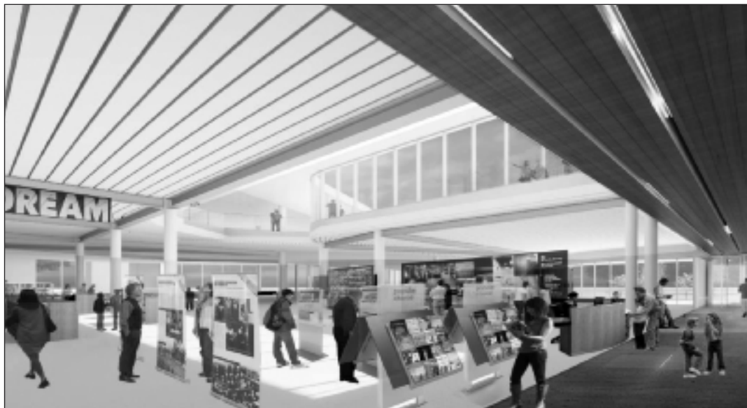
Interior view of the proposed Advanced Learning Library.

Other amenities of the proposed building include a drive-up returns and pick up window, an outdoor programming space for children, dedicated parking and improved access to the public transit system.